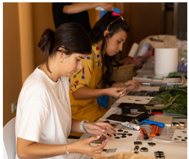
Residency for illustrators to cooperate with international publishers