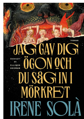
Swedish translation of the book / gave you eyes and you looked into the darkness