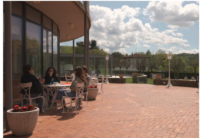
Discussions between the participants of the environmental sustainability stay.