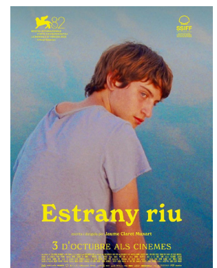
Poster for the movie Strange River.