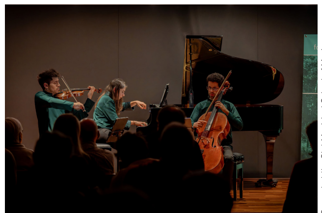
Concert at the Olot Municipal School of Music.