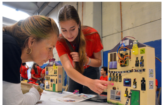
Robotics and programming for education.