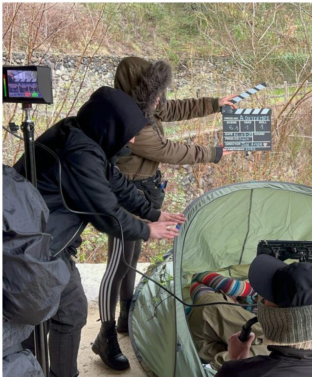
Hackathon: Film Residency for Young Talents